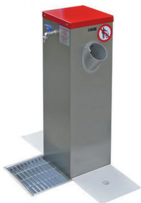
art.S-302 easy eye dimensions: cm.30x30x96h