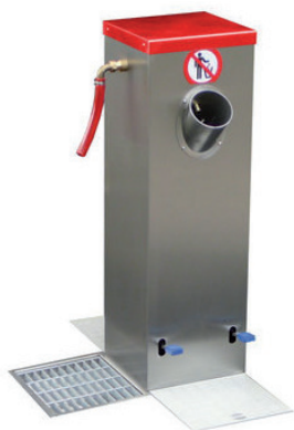
art.S-301 easy dimensions: cm.30x30x96h