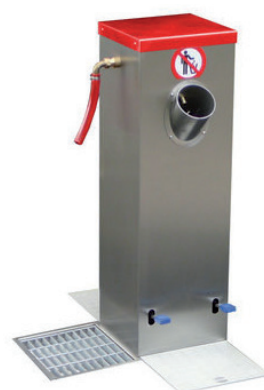
art.S-303 smart dimensions: cm.57x38x120h