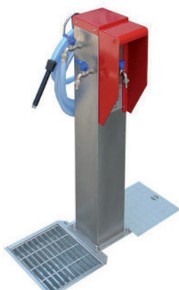
art.S-402 easy plus dimensions: cm.13x13x95h