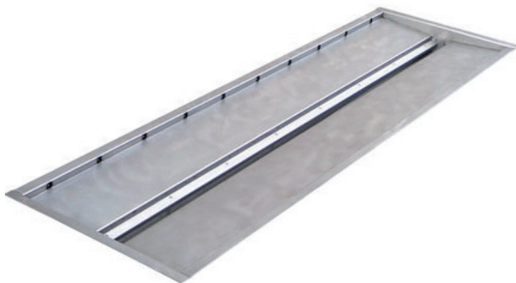
art.P-104 large basic