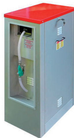
art.S-403 smart dimensions: cm.57x38x120h