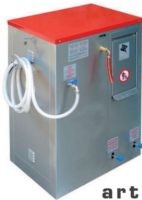
art.S-206 smart a dimensions: cm.80x56x120h