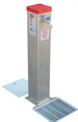
art.a-401 easy dimensions: cm.13x13x95h