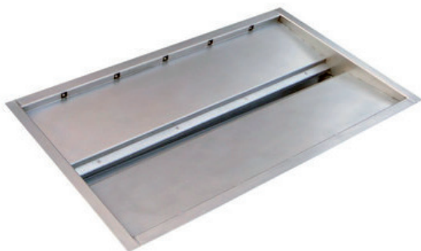
art.P-102 medium basic

Les évacuations P-SUN dans la version Basic sont également disponibles sans le système auto-nettoyant (sans buses). Cette option sous entend le nettoyage manuel de la surface d'évacuation.