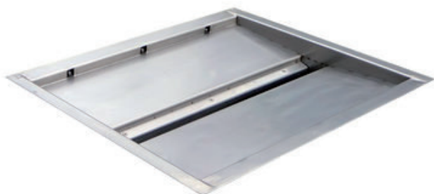
art.P-101 small basic